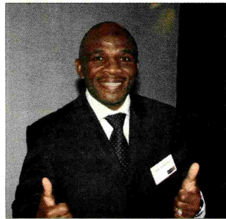
BOXING BIRTHDAY WISH: Baby Jake Matlala said, "Mandela is an inspiration to us all. He is my adviser and showed me that reconciliation was the way forward. I would like to wish Mandela a happy 94th birthday and to celebrate his birthday I will be in Cape Town on 21 July for the match between Man United and Ajax Cape Town."